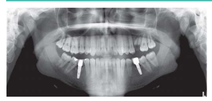
Fig. 10: Postoperative (Case 2)