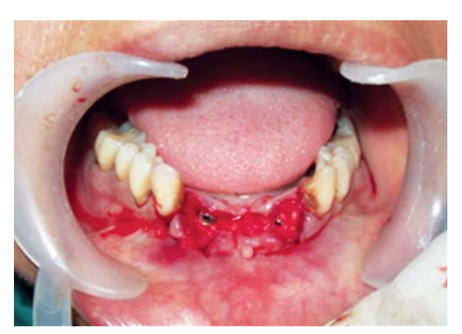
Fig. 5: Implants inserted