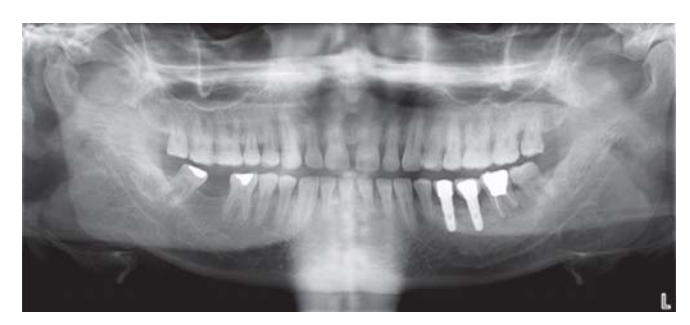
Fig. 8: Postoperative (Case 1)