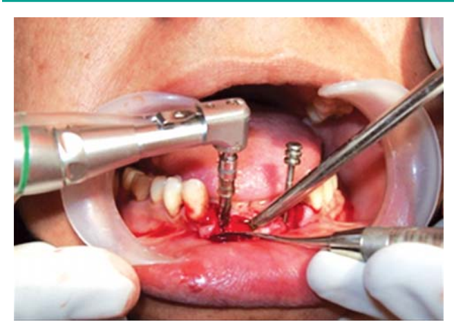
Fig. 4: Drilling the osteotomy