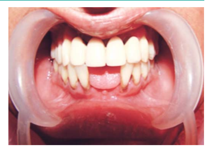
Fig. 1: Preoperative picture