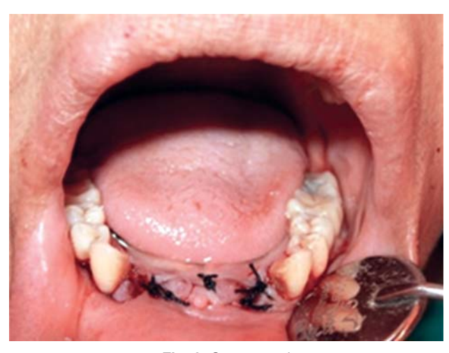
Fig. 6: Site sutured

or peri-implant radiolucency. All the implants were firm on re-exposure, except one which was placed in the region of 44. Implant was then removed and the site was curetted and left for healing by secondary intention.