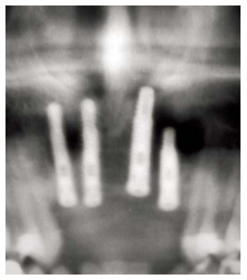
Fig. 11: Dental implants in situ

Both were attributable to noncompliance regarding postoperative care instructions regarding exercise and mobilization of the leg in the immediate postsurgical period.