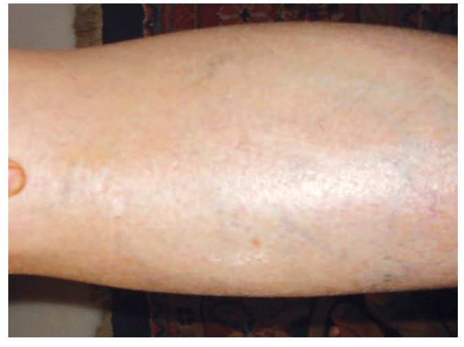
Fig. 6: One-year postharvest donor site scar

A mild compressive occlusal crepe dressing (elastoplast) was placed over the wound for the next 7 to 10 days. Suture removal was routinely done between the 7th and the 12th day depending on the clinically evident healing at the time.