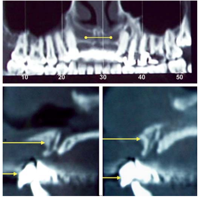
Fig. 1: The dentascan CT shows the loss of bone volume in anterior maxilla and reduced anteroposterior width of cortical bone

Skin markings were made with marking ink after identifying patella, upper end of the shaft of the tibia and patellar tendon.<sup>1</sup>