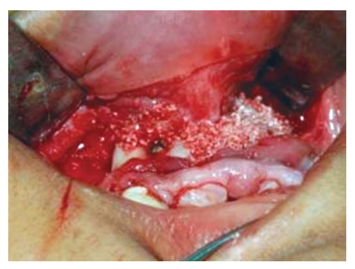
Fig. 7: Alloplastic bone-substitute + cancellous (tibial) bone incorporated around the autogenous blocks

Radiographs of the donor site (tibia) as well as the recipient site (anterior maxilla) were taken preoperatively, and postoperatively (7th and 90th day) (Figs 9 and 10).