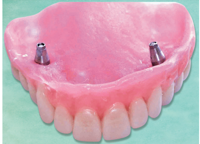
Fig. 3: Two modified impression copings were incorporated in the trial base