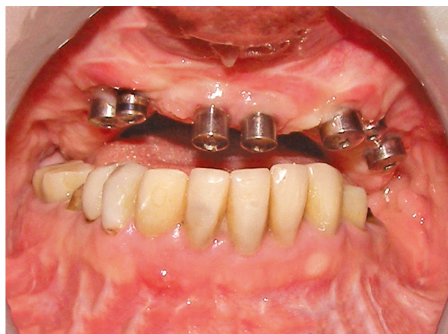
Fig. 1: Frontal view of implants

not be used for screwing and unscrewing the impression coping pin. Therefore, a horizontal groove (slot) was prepared on the cut surface of transfer pin so that a small short-handled flat-ended screwdriver could be used for securing the shortened impression copings into the corresponding implants (Figs 2 to 4). The wax rim was fabricated incorporating two shortened impression copings and VDO, and the centric relation were registered for an accurate mounting of casts on the articulator. The same record base was used to try in the denture teeth arrangement (Figs 4 and 5).