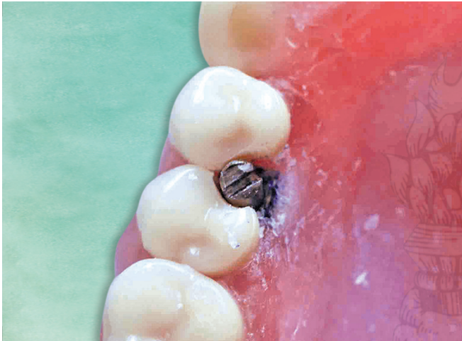
Fig. 4: Transfer pin head is shown after cutting, securing the modified impression coping