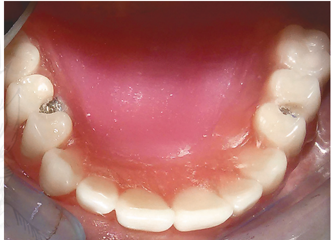
Fig. 5: Trial base with artificial teeth and two modified impression copings in the mouth