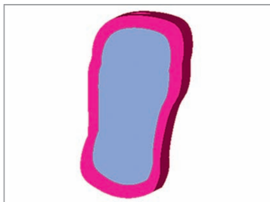
Fig. 1: Model of cortical and cancellous layer of D2 bone

The area of maximum stress was found at the crest of the cortical bone, i.e. at the neck of the implants for all the