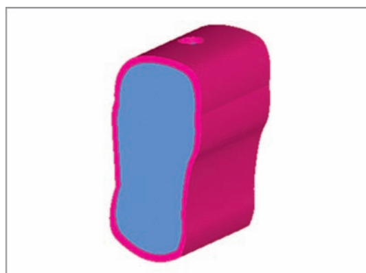
Fig. 2: Model of cortical and cancellous layer of D3 bone